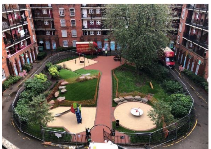
Upper Hilldrop Estate Improvements