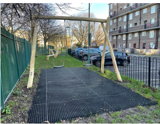
St George's Ward Estate Planters (now Tufnell Park ward)