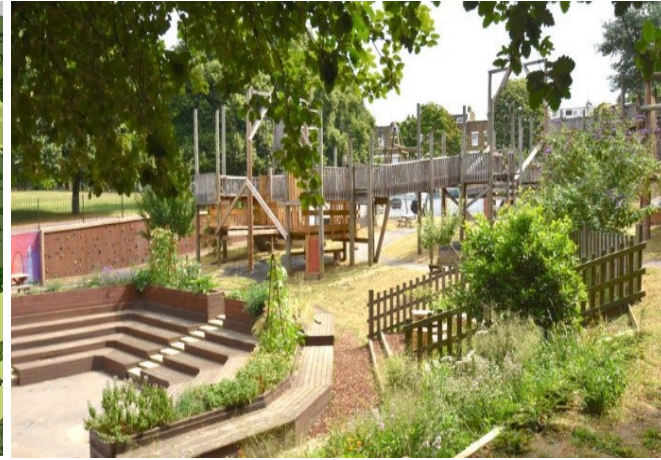
Myddleton Square and Granville Square Play Area