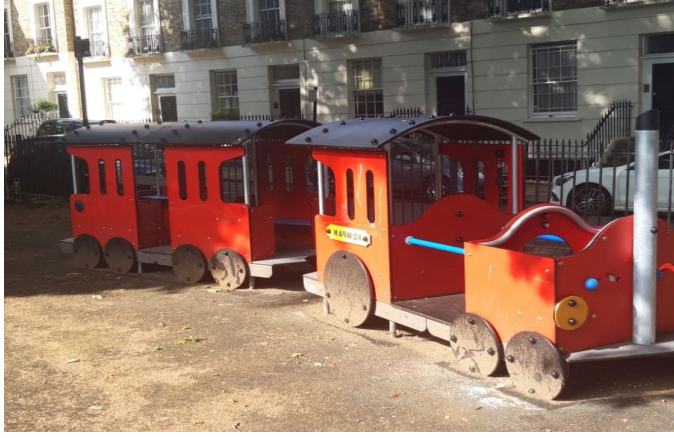
Astey's Row Multi Use Games Area and Play Facilities