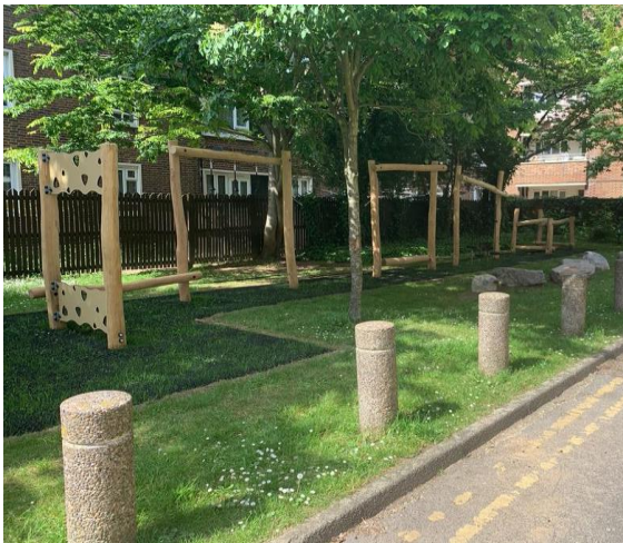
New playing facilities in Crouch Hall