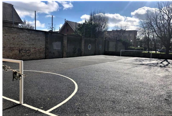
Multi-use game area renewal in Haslam Court