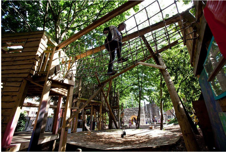
Crumbles Castle Adventure Playground