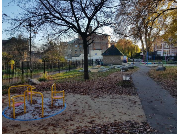
Astey's Row improved Public Realm