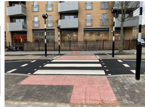
New Zebra Crossing and signage on North Road