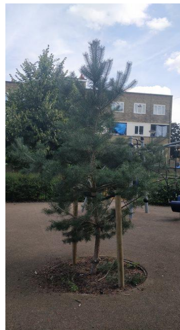
Newly Planted Trees in Finsbury Park