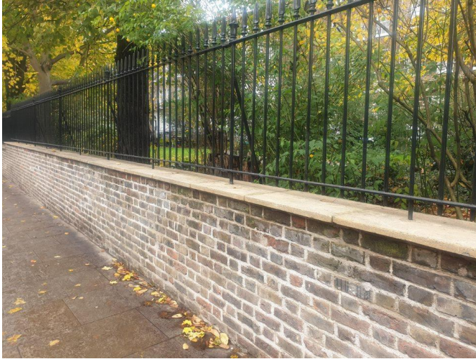
Renewed fencing in Compton Terrace