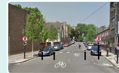
6 Elmore Street Camera enforced traffic filter at existing width restriction – two parking bays suspended