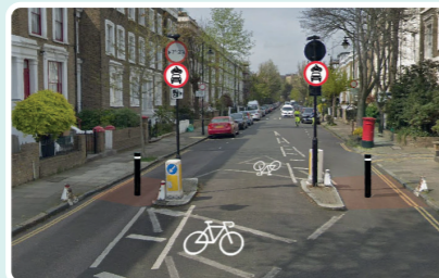
3 Ockendon Road Camera enforced traffic filter at existing width restriction – four parking bays suspended