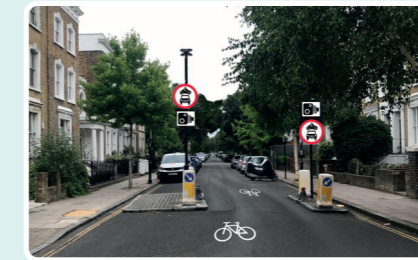
5 Northchurch Road Camera enforced traffic filter at existing width restriction