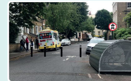
7 Cleveland Road Physical traffic filter with bollards - four parking bays suspended