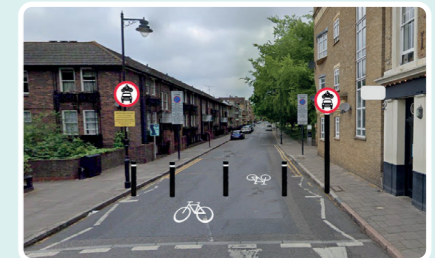
10 Shepperton Road Physical traffic filter with bollards - four parking bays suspended