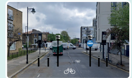
9 Downham Road Camera enforced traffic filter allowing buses through – three parking bays suspended