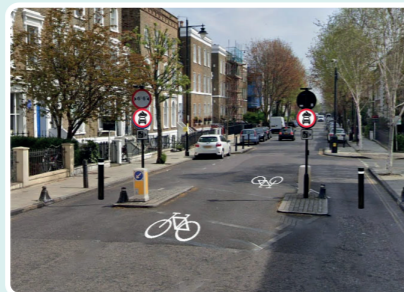
4 Englefield Road Camera enforced traffic filter at existing width restriction