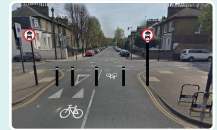
8 Halliford Street Physical traffic filter with bollards – four parking bays suspended