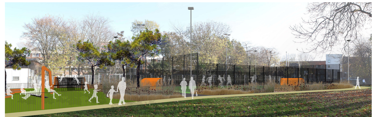
View of the proposed 3G football pitch from the footpath adjacent to Gifford Street entrance looking south-east