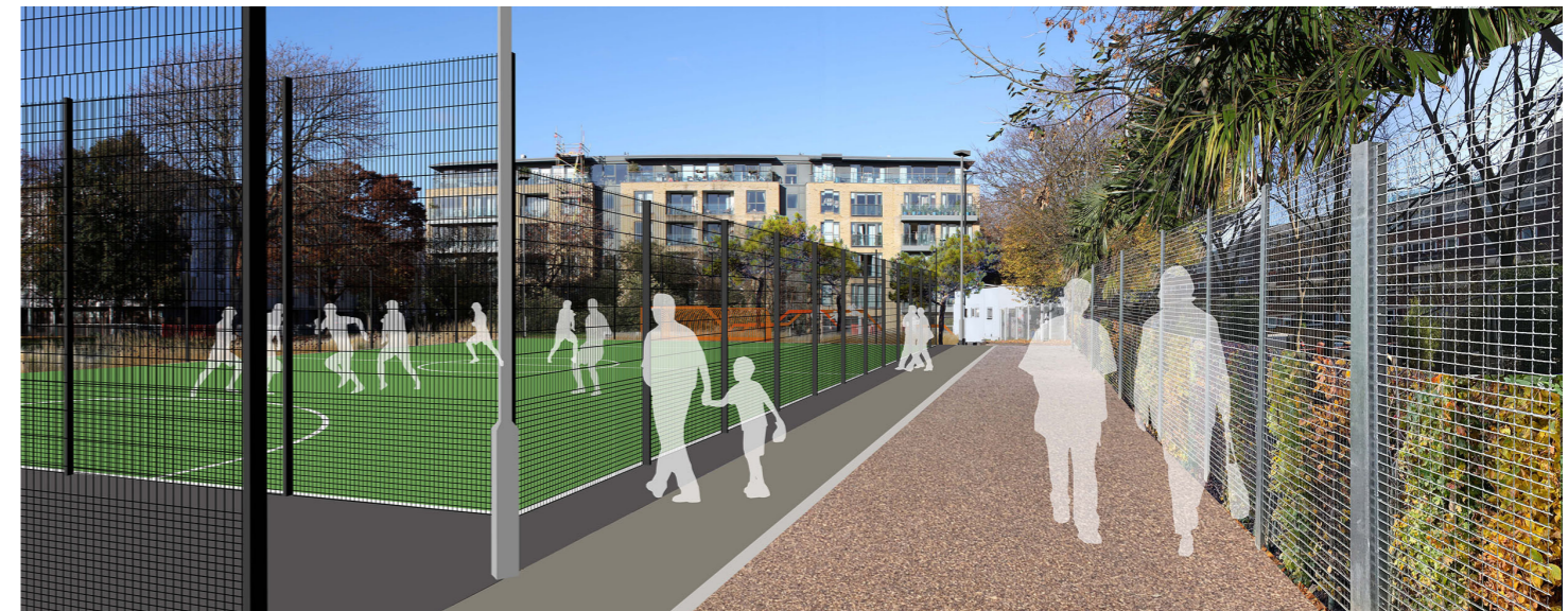
View of the proposed 3G football pitch from the footpath adjacent to Crumbles Castle Adventure Playground looking north.