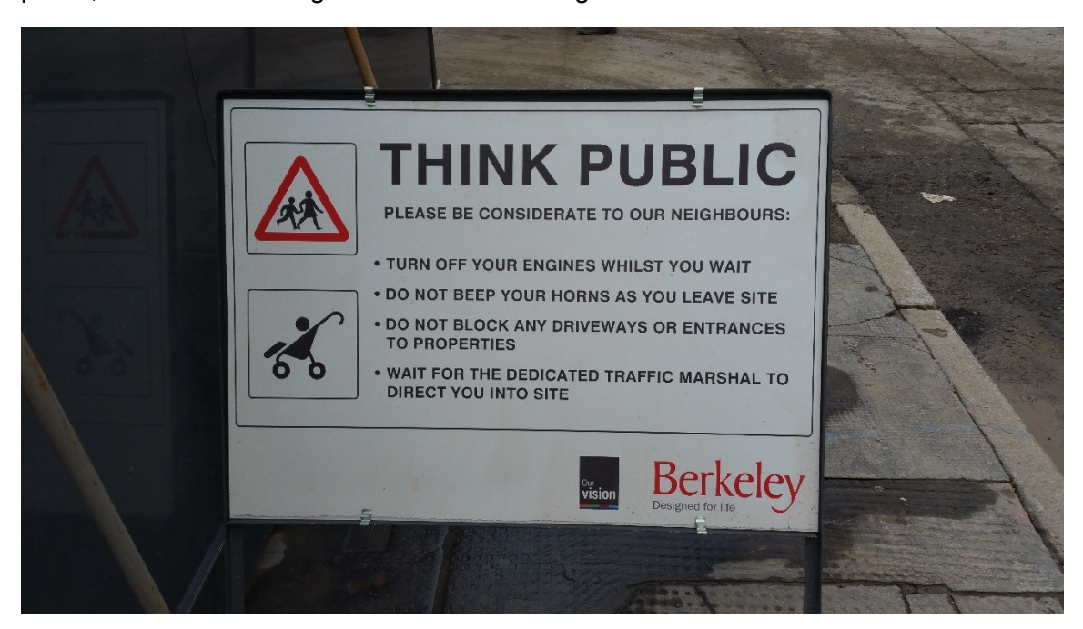
Figure 2: Simple measures such as signage at the site entrance can inform driver behaviour

13.5. Certain roads within Islington are subject to height, weight and width limits for vehicles. This must be considered when planning vehicle routes to and from the site. Further information can be found on the Council's website, from the Metropolitan Police or the Highways Agency. It is advised that a Construction Logistics Plan is produced prior to work starting, in consultation with our Highways department, to include permitted access routes for construction traffic and loading controls.