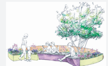
Artist's Impression of proposed planters with integrated seating

Proposed footway build outs provide extra width for