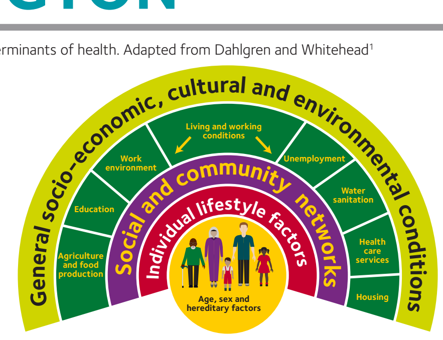
Figure 1. The wider determinants of health. Adapted from Dahlgren and Whitehead<sup>1</sup>