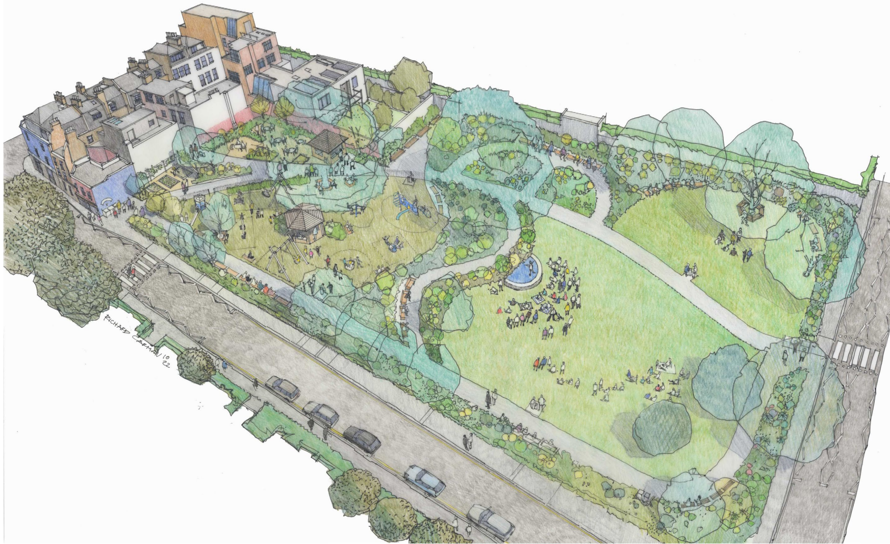
Artist impression of an aerial view of the park