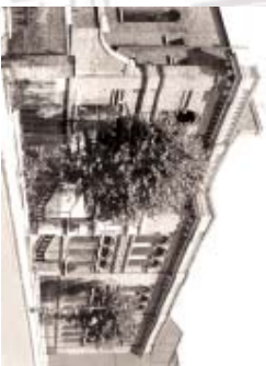
North London Synagogue