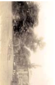
Barnsbury Square Gardens