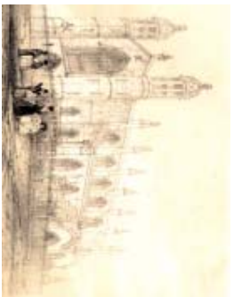
Holy Trinity Church