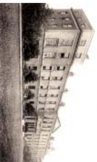
Church Missionary College