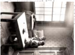
Barnsbury Park School