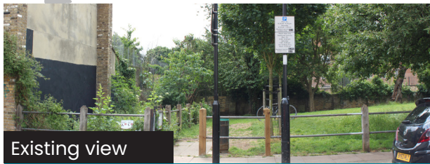
View from St Jude Street