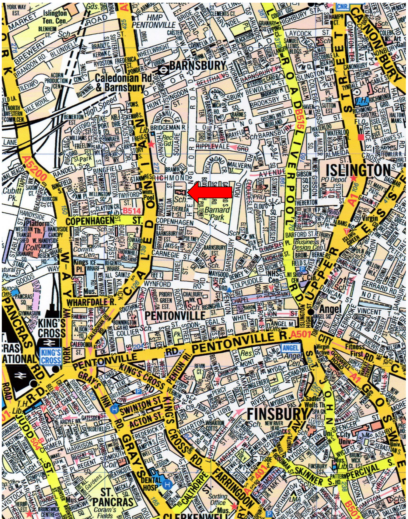
Map showing the location of St. Andrew's School within Islington