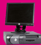
computers & televisions