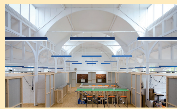
Main hall at Granville Centre