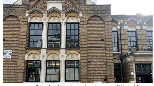
Exterior facade and entrance of West Library