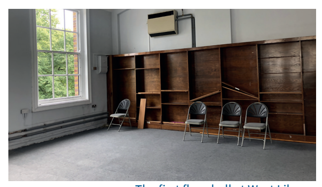
The first floor hall at West Library