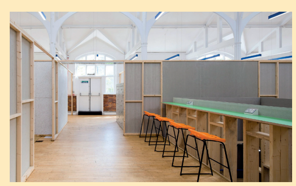
Desk space for co-working at Granville Centre