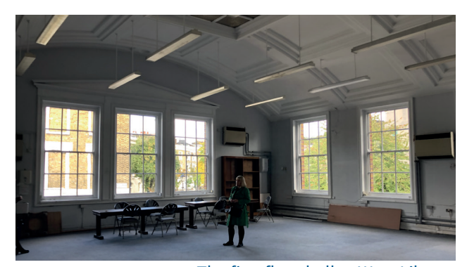
The first floor hall at West Library

Offer an informal space where young people can use computers and free WIFI.