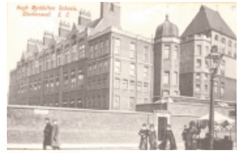
Hugh Myddelton School