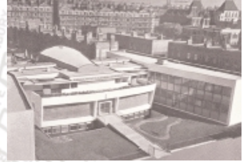
Finsbury Health Centre