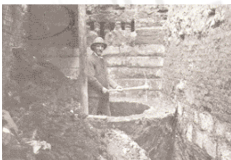
The Clerks Well