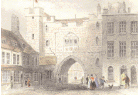
St John's Gate