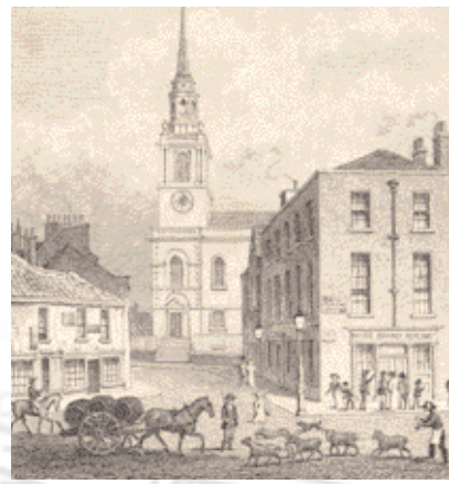
St James Church