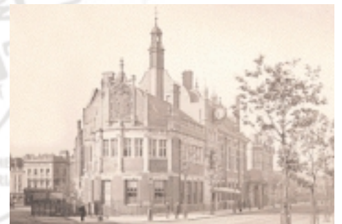
Clerkenwell Vestry Hall (Finsbury Town Hall)