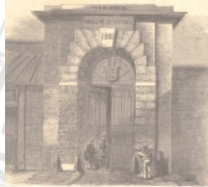
House of Detention