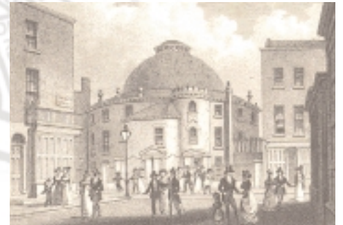
Spa Fields Chapel