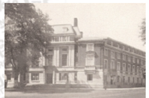
Metropolitan Water Board Offices