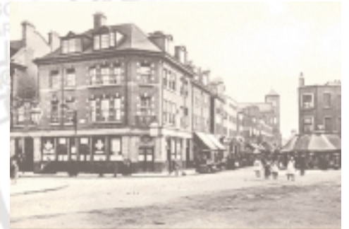
Exmouth Street & The London Spa