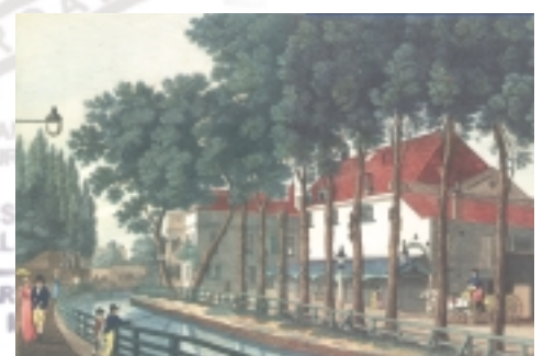
Sadler's Wells Theatre