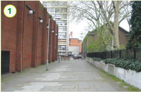
1 Rear view of Finsbury Leisure Centre. Blank walls are facing onto St Luke's Gardens.

The plan and photographs below show the current layout of the two buildings and surroundings and also highlight some of the problems we would like to address with this proposed redevelopment.