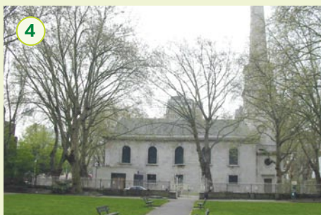
4 Potential outlook onto St Luke's Gardens.