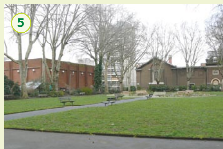
5 Blank walls facing onto St Luke's Gardens.