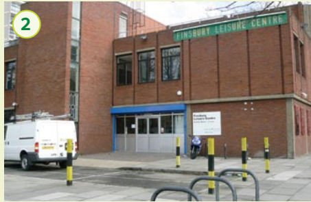
2 Current entrance of Finsbury Leisure Centre does not face onto St Luke's Gardens.