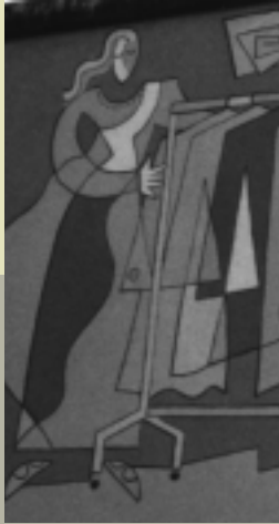
Mural depicting local industry