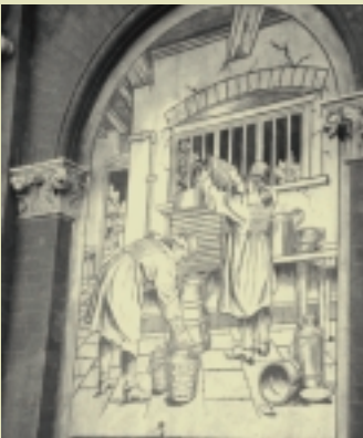
A romantic take on dairy production

This 19th century corner of Islington has developed into a busy, multi-ethnic neighbourhood. Stroud Green Road has a lively variety of locally-owned food shops, restaurants, and specialist shops. Nearby streets have interesting features, and there's the green, wooded Parkland Walk away from traffic. The route climbs rather gently to the top of the hill, but the W7 bus will also get you there and you can walk down.