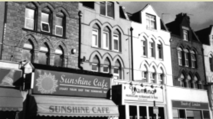
Fine facades rising above the present day facias of Stroud Green Road

for train times and fares from crouch hill