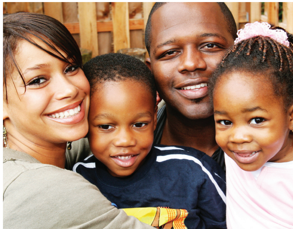
Images posed by models in order to protect identities

Rebuilding the lives of survivors of torture, organised violence and gross human rights violations.