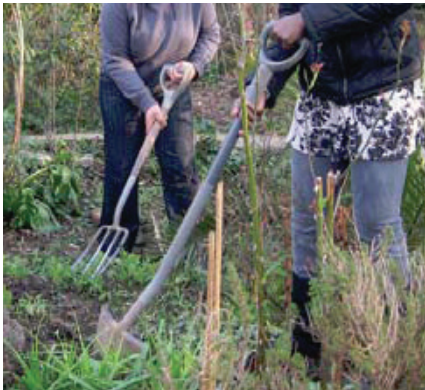
Women's gardening project in action at Room2Heal.

“I felt dead until I came into this group. If I feel down, it transforms me to come to the garden.”