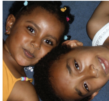
Children and family group counselling session at the Medical Foundation.