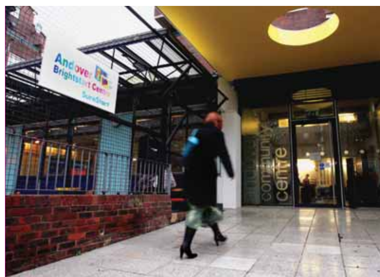
Home to the estate library, the newly refurbished community centre has become a hub of activity on the Andover Estate, with events ranging from fitness classes to children’s crèches.