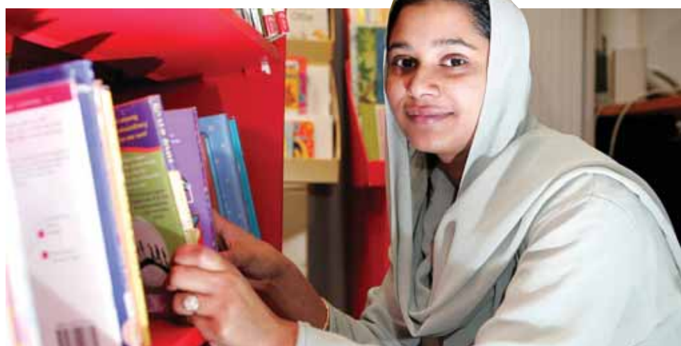
Many residents visit the library, borrowing around 100 books in each session

community works. I knew that we had to adapt this project to suit the way people live so, for example, cutting out all the red tape like fees and fines works because if people are treated with trust, then they will repay it."