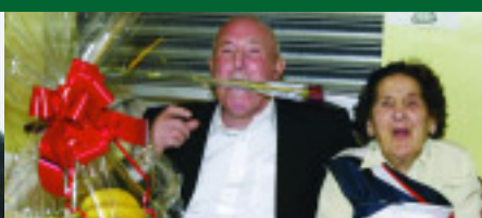
Love is all you need