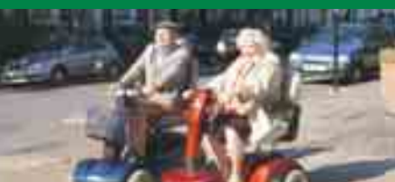
On the move