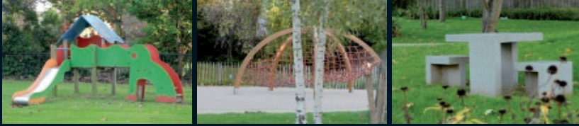
Whittington Park Davenant Gardens