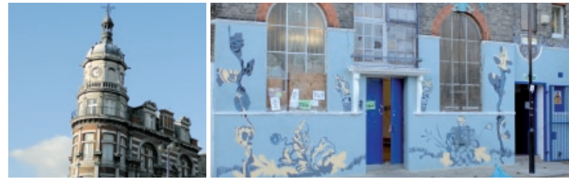
Boston Arms Pub Whittington Community Centre

Come out of Tufnell Park underground station with its distinct red tiling. Turn right past the station and walk down Tufnell Park Road ①, thought to run along the lines of a Roman road. It cut through the centre of William Tufnell's estate and the medieval manor house stood at the east end of the road, where you now see a cinema. Private houses along here can boast five bedrooms, two reception rooms and a handsome price tag. Turn down the third road on your left, Campdale Road ②. On Campdale Road you'll see Tufnell Park itself ③ – a large open park with playing fields, a playground and two tennis courts. Continue walking along to the end of the road and turn right onto Foxham Road. Rather than walking down the road, turn right into Foxham Gardens and note another one of the area's playgrounds at the end. Turn right into Yerbury Road and then left into Whittington Park ④. Opened in 1954