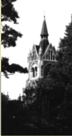
The Union Chapel, 'the non-conformist cathedral'