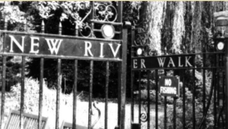
One entrance to Islington's linear park