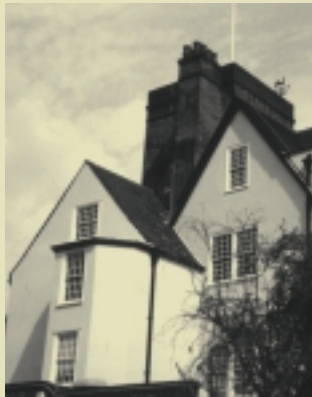
The distinctive profile of Canonbury Tower

The trail goes through two contrasting 19 th century suburbs. Canonbury took its late Georgian form in the early part of the century around a medieval manor. Highbury New Park was developed on a more spacious scale in the latter decades. Newington Green, however, was a much earlier urban outpost. The trail is fairly level, often following the route of the New River.