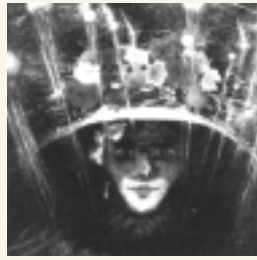
Umberto Boccioni, 'Modern Idol', 1911