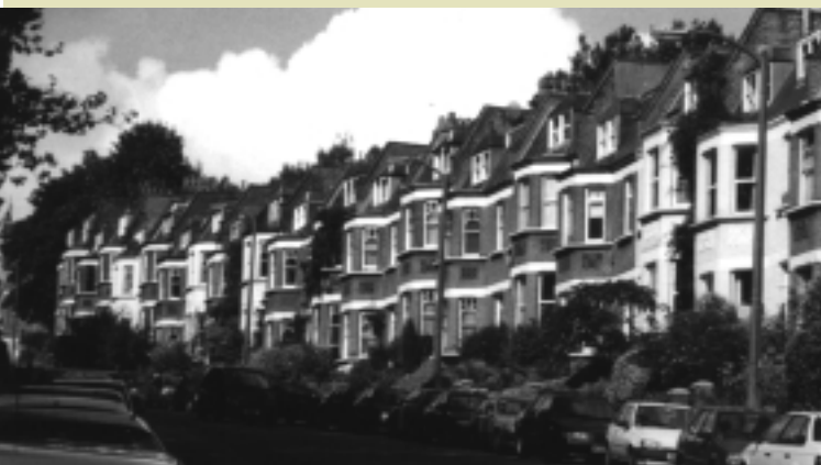
Victorian terraces on a grand scale with the spacious family houses that form a large part of the area