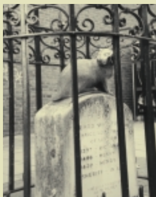
Whittington's Stone with his cat

This is a hilly walk with the reward of good views and pleasant, tree-lined residential streets. If you take a bus to the top of Highgate Hill, the rest of the trail is mostly downhill. Despite traffic noise, the shops and cafés along Junction Road and Holloway Road are worth exploring.