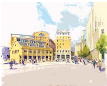
This is an artist's impression of the proposed 'Station Square' showing the German Gym.

In addition to the applications there are a number of supporting documents , for example the Urban Design Statement . These documents provide further details and background information to the proposals.