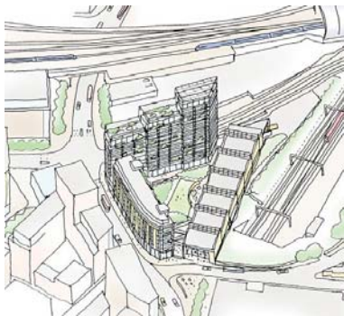
The Triangle Site beside York Way and Randells Road could be developed this way.

Remember — the last day for comments to be received is Friday 8 October 2004