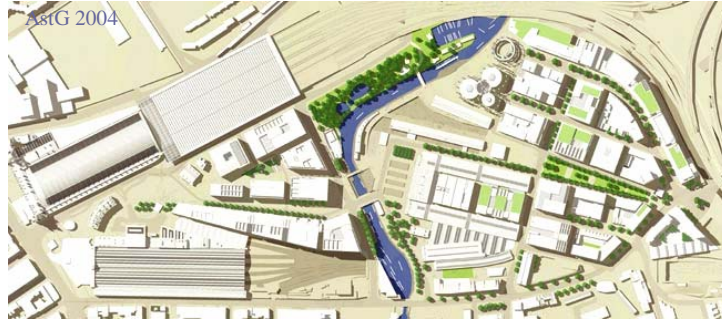
Computer image from the developers of how King's Cross Central could look in the future.

The long-awaited outline planning applications for the King's Cross Central development were submitted on May 28th 2004. Details of the various consultation events being held in both Camden and Islington are found on page 2.