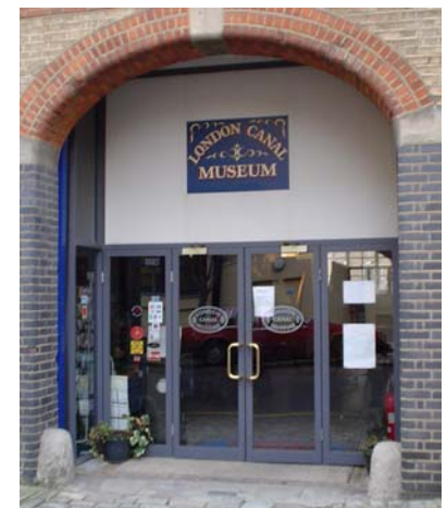
There are already numerous creative industries and cultural institutions in King's Cross. We want to see more!

To learn more about the above please contact us (see details on the back page).