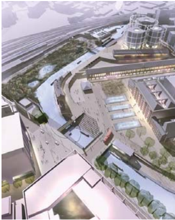
This illustration shows how the area around Regent's Canal and the Granary could look.

You can find this picture and more at www.argentstgeorge.co.uk