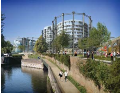
Potential view of the gas-holders by Regent's Canal