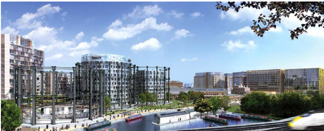
Computer illustration by Argent of what the gasholders could look like

The revisions to the original plans have been made following ongoing discussion between the two councils, and in response to the many consultation comments submitted by local residents and other key stakeholders.