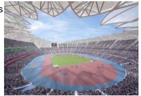
Proposed Olympic Stadium in Stratford.

The new shuttle train, taking only 7 minutes will connect two of the largest new areas in