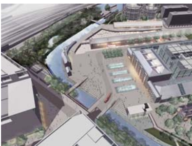
Bird's eye view of Granary Square and Regent's Canal

As with the original applications, the councils are undertaking an extensive consultation of the revised plans. The consultation period is running: