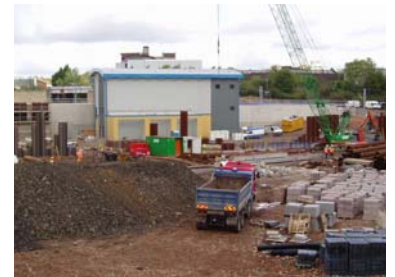
The Triangle under construction

Islington is hoping to take the joint report to committee in the spring of 2006.