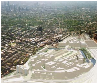
King's Cross Central could become a completely new quarter of London