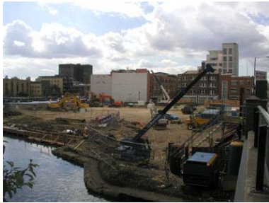
The site is being cleared making way for the new King's Place building