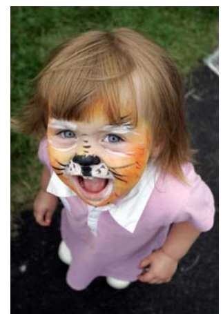
One of the many happy faces at the opening of the improved Bingfield Park

On a related note, the proposed development of the former William of York school site was passed by the West area committee on 10 October and received full planning permission. There will be 140 + 14 flats on the site which backs on to Bingfield park.