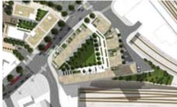
The Triangle—part of the illustrative plan for King's Cross Central

councils will write a joint report recommending refusal or approval of the development. This