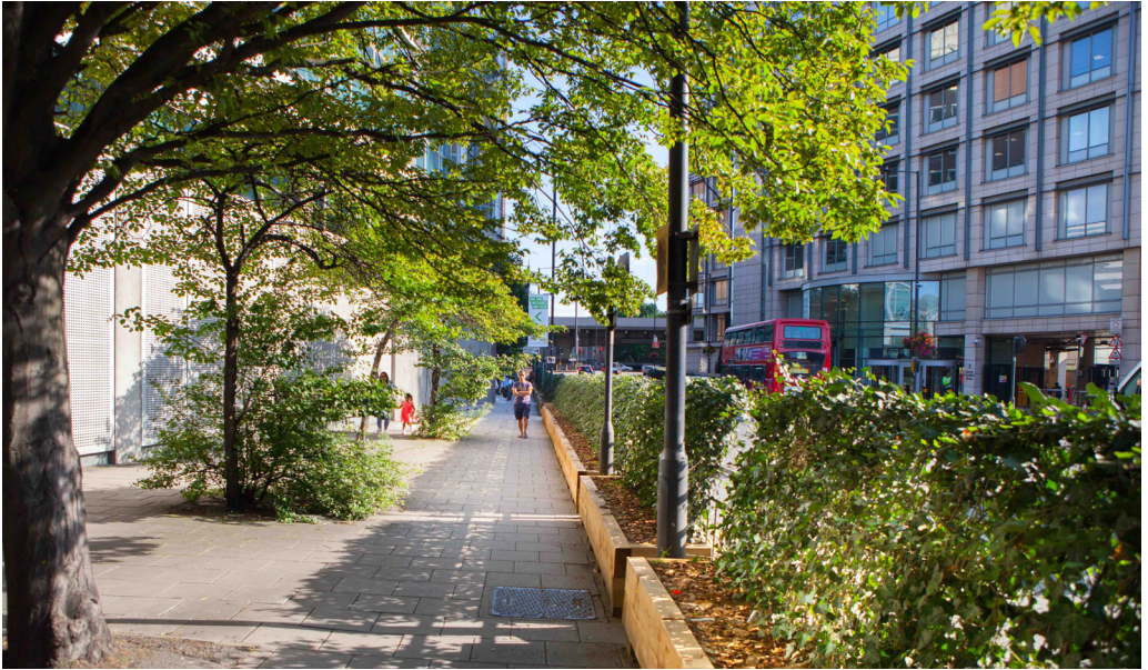
Figure 2: Example of living green screen in timber planters