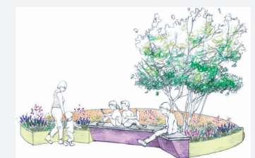
Artist's Impression of proposed planters with integrated seating